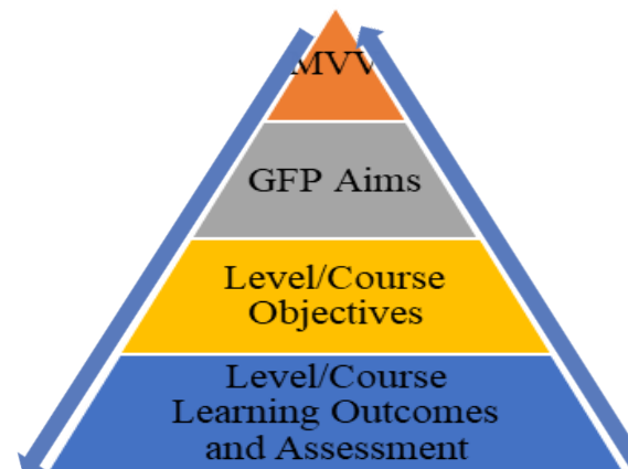
Figure 1. Relationship of MVV to GFP Curriculum

Level/Course Learning Outcomes (LOs) are developed with reference to the MVV. The achievement of LOs leads to the achievement of MVV.